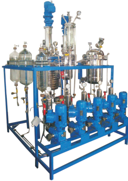
Pilot plant including gas and liquid feed systems, and gas/liquid separators