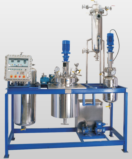
Available with control systems including SCADA Software