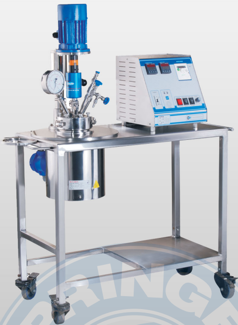
High pressure stirred autoclaves up to 100 liters