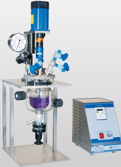
Glass body Autoclaves up to 2 Liters