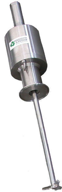
Sanitary top entering lab and pilot plant mag-drive sealless mixers