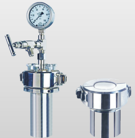
Non-stirred high pressure vessels up to 25 liters and 350 bar