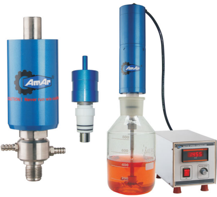
Laboratory size sealless magnetic stirrers