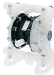
Husky 515, Poly

All written and visual data contained in this document are based on the latest product information available at the time of publication. Graco reserves the right to make changes at any time without notice.