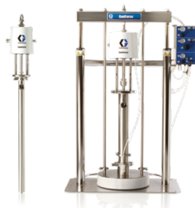
SaniForce 6:1 Piston Pump