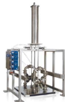
SaniForce 3150 BES

All written and visual data contained in this document are based on the latest product information available at the time of publication. Graco reserves the right to make changes at any time without notice.