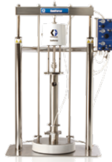
SaniForce 5:1 Drum Unloader