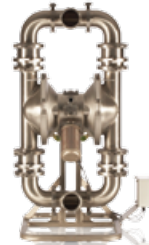
SaniForce 3150 3A