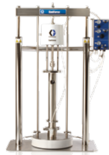
SaniForce 5:1 Drum Unloader