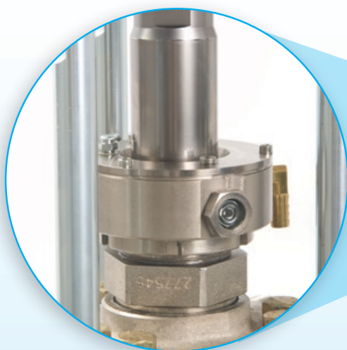
Sealed Wet Cup

Long-Lasting Piston Pumps with Sealed Wet Cup