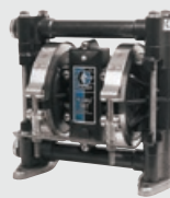
Husky™ 307 3/8 inch Pump