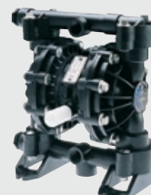
Husky 515 1/2 inch Pump