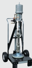
President® 10:1 450 Cart Mount