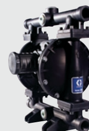
Husky 1050 1 inch Pump Family