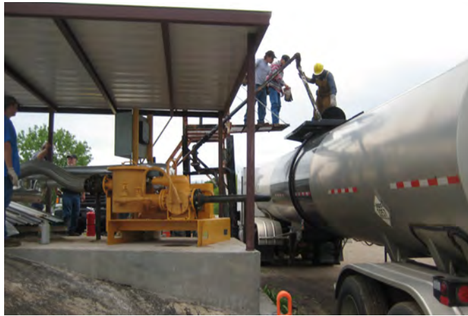
Haskell Lemon personnel starting up the loading process