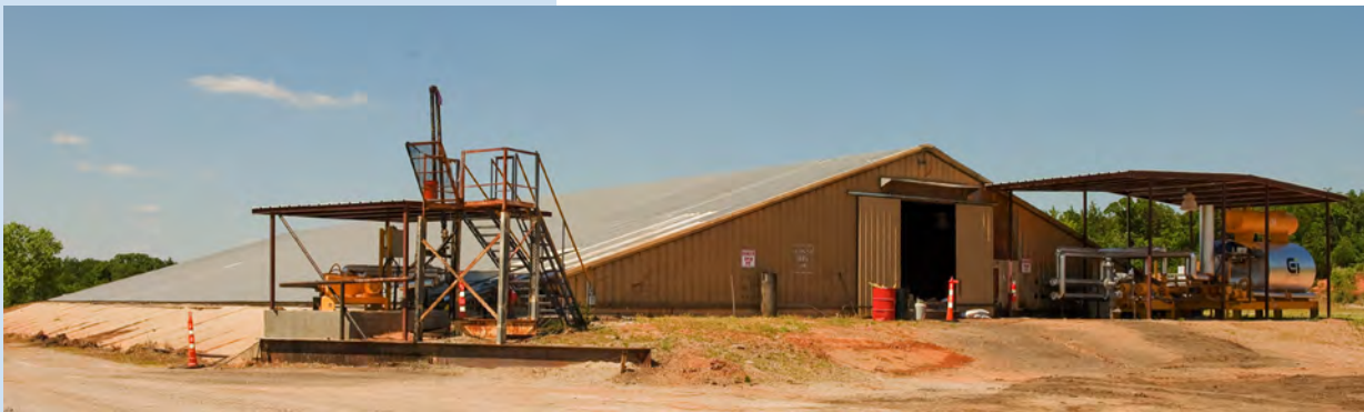
Haskell Lemon's 1.5 million gallon underground asphalt storage tank