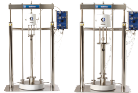
SaniForce 6:1 Drum Unloader