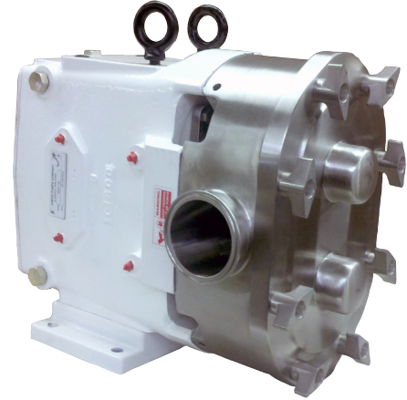
When you could buy this!