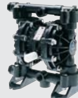
Husky 515 1/2 inch Pump