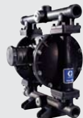
Husky 1050 1 inch Pump Family