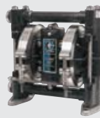
Husky™ 307 3/8 inch Pump